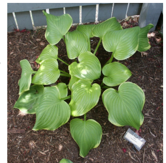
H. 'Fragrant Bouquet'