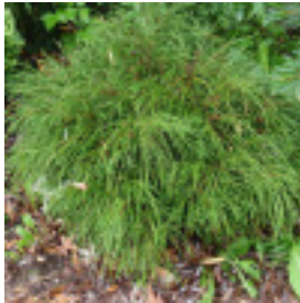
Thuga plicata "Whipchord" - check out Blue River Nursery

Next month we will have the listing for all upcoming meetings. We do know of two dates, May 20/21, 2011 will be the Five Family plant sale with the IPHS Potluck and meeting/program at the Schroeder's on the 21st. The second firm date is June 11 & 12, 2011 when we will head to St. Louis for a 2-day visit to 5 gardens, a garden center and the St. Louis Botanical Garden.